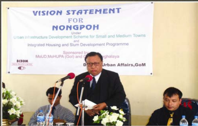
Meghalaya Chief Minister Dr. D.D. Lapang speaking at the presentation of the Vision Statement for Nongpoh in a function held at the Resource Centre of the DRDA, Nongpoh, on March 27, 2007.