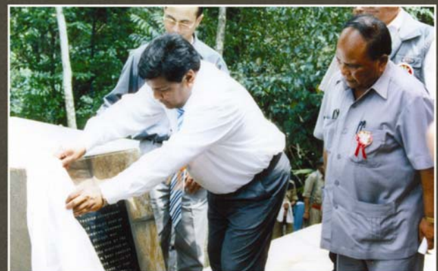
Meghalaya Minister of Tourism, Mr. Charles Pynngrope unveiling the plaque to mark the inauguration of the newly constructed Tourist View Point at Nongwar village on May 30, 2007.