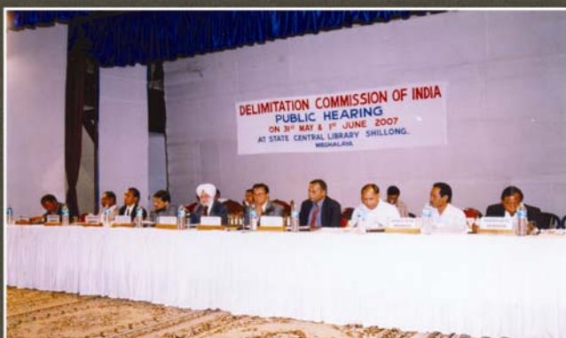
Public Hearing of the Delimitation Commission of India held at U Soso Tham Auditorium, Shillong on May 31 & June 1, 2007