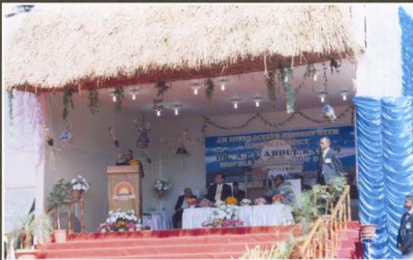
President A.P.J. Abdul Kalam delivering his address and interacting with students and faculty at the North Eastern Hills University, Mawlai Umshing, Shillong.