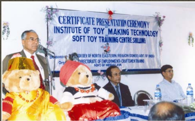
Meghalaya Chief Secretary delivering his address during the Certificate Presentation ceremony of the institute of Toy Making Technology at I.T.I. Shillong on June 1st, 2007