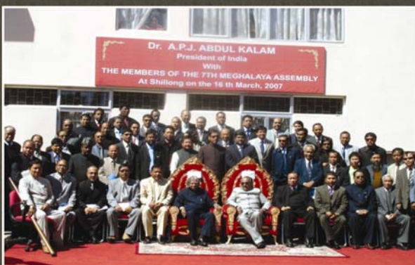
President A.P.J. Abdul Kalam taking with members of the 7th Meghalaya Assembly (left photo) and unveiling a plaque to commemorate his historic address to the Meghalaya Legislative Assembly (right photo)