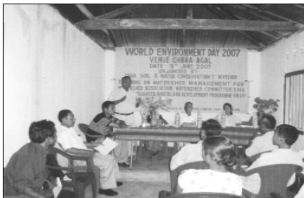
A Resource Person delivering speech at Chibra Agal, West Garo Hills