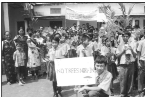
Young hands for young plants