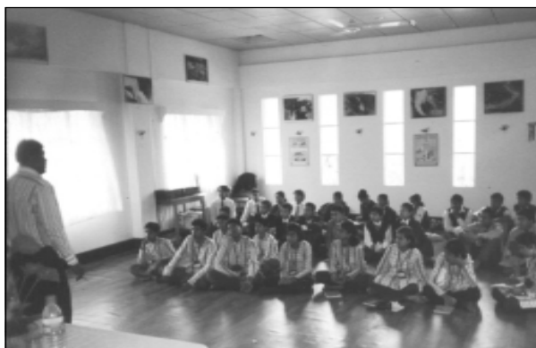
School children: in rapt attention