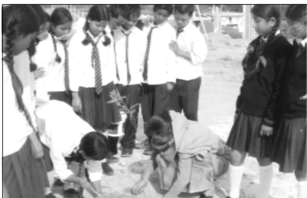
Teacher and students planting a sapling during World Environment Day

The seedlings of Jatropha, arecanut and black-pepper are planted by the students and this time, a strategy was adopted in which each student was entrusted for the upkeep and maintenance of each sapling planted. Students will be awarded marks in their academics for maintenance of the trees planted.