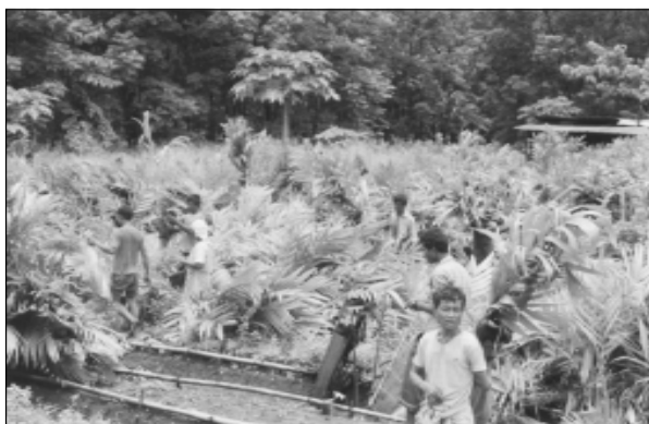
Seedling distribution: intensifying production