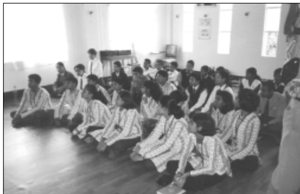
All ears: young environmental campaigners