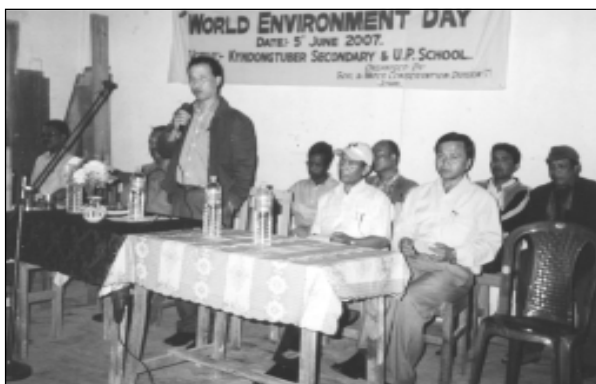
World Environment Day: remembering the call