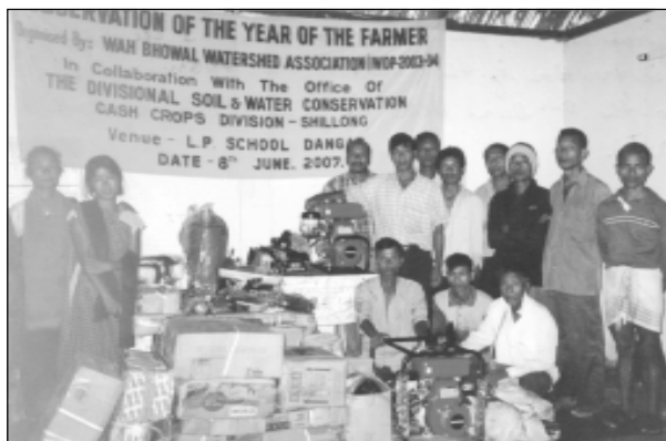
Farming equipments: tools of the trade