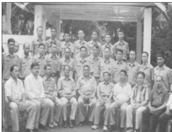
Trainees with Instructors