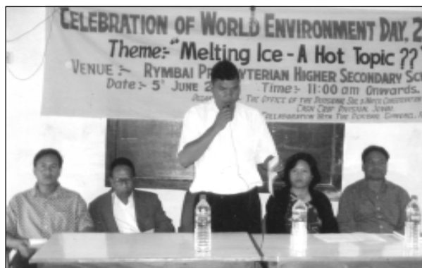
A World Environment Day function in progress in Jaintia Hills